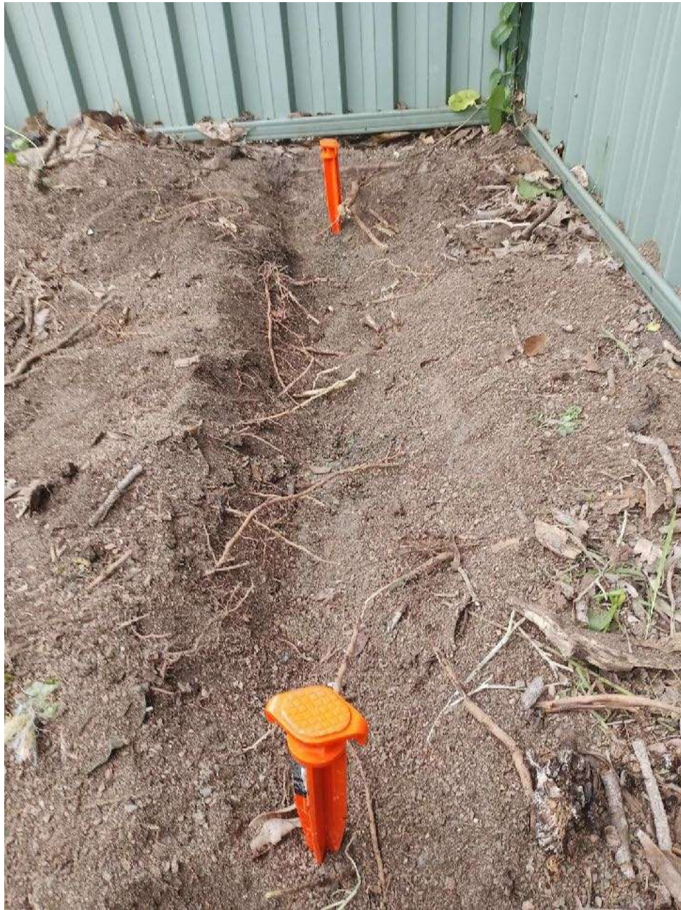
Fig. 2. View of the part of the trench show tiny roots from the tree as well as tees on the subject site such as Murraya paniculata and Erthyrina species . (Photo: T.J. Hawkeswood).