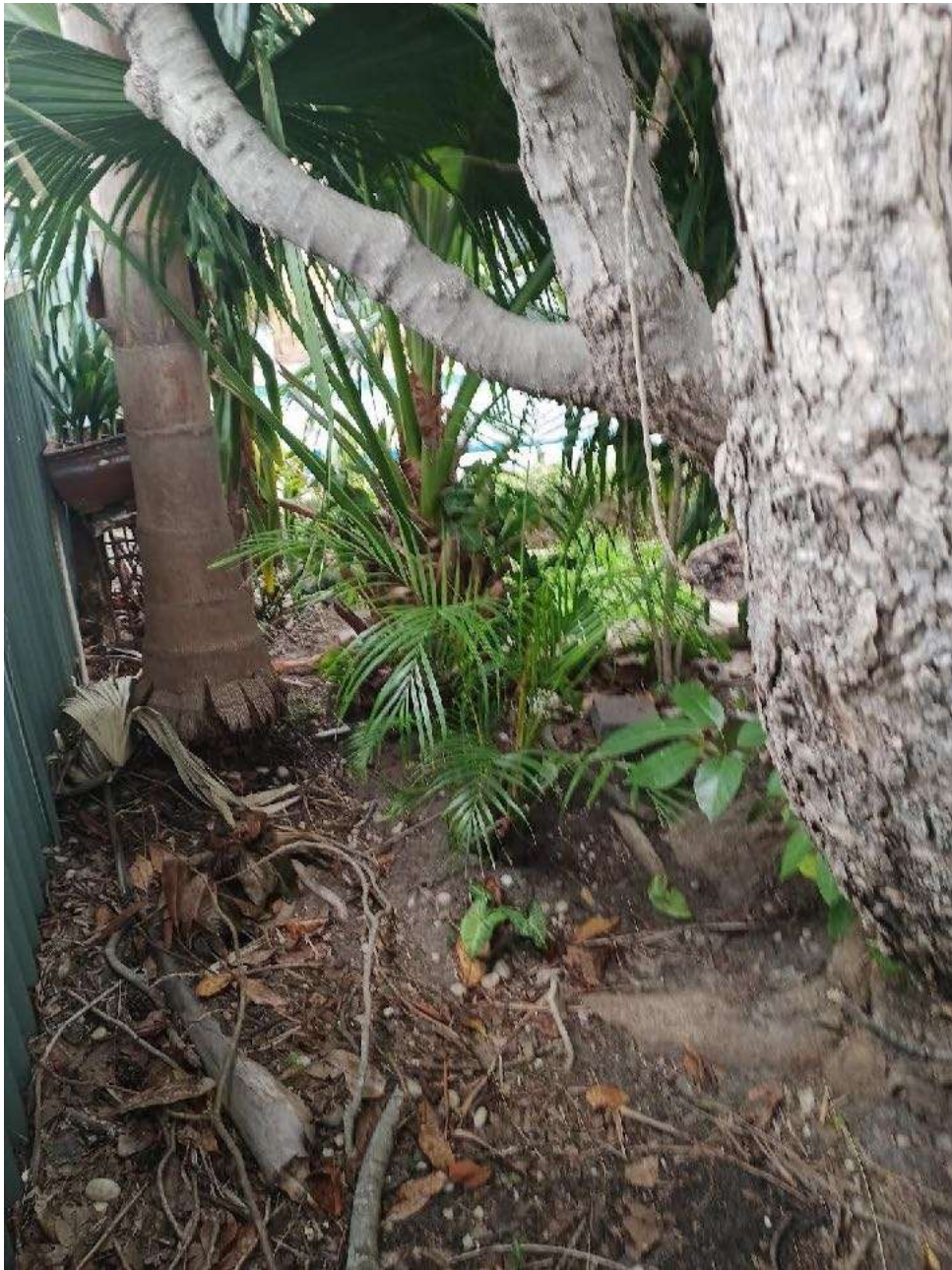
Fig. 1. View of the base of the tree. Note swimming pool near the tree.