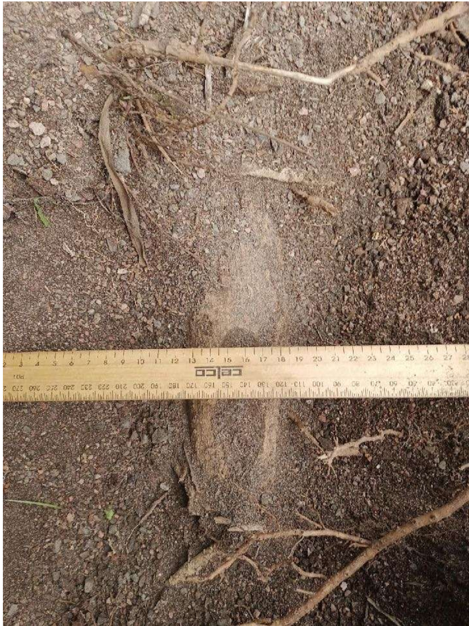
Fig. 5. A third larger root detected.