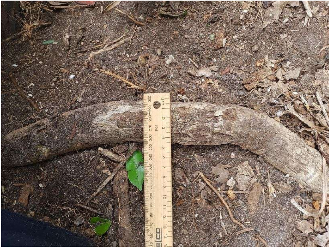
Fig. 4. A second larger root detected.