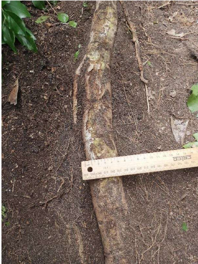
Fig. 3. One of the four larger subsurface roots from the rubber tree detected in the trenching. (Photo: T.J. Hawkeswood).