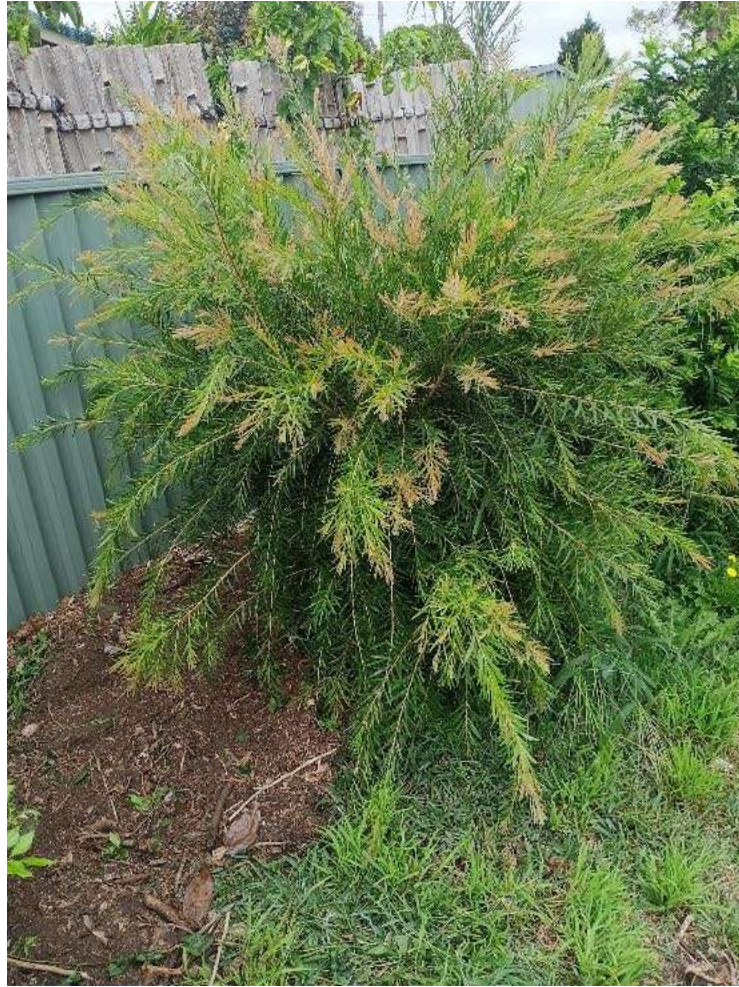
Fig. 6. Callistemon salignus pruned tree - roots of is tree were detected.